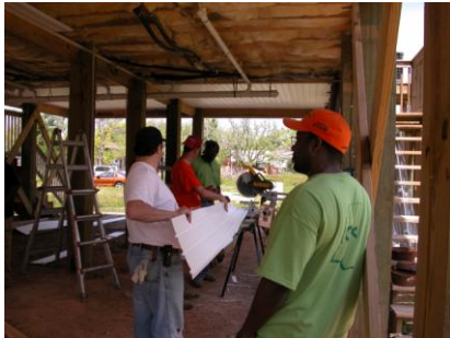
SAFE House men and Grace men working together