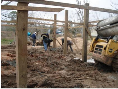
Before: Site from 2007