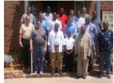
16 members and a new friend at church on Sunday