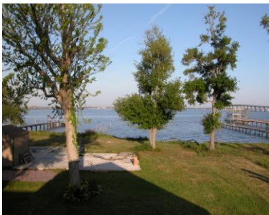
Yard outside the finished house