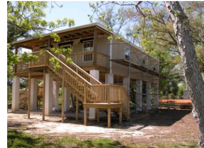
After: Finished project!!!