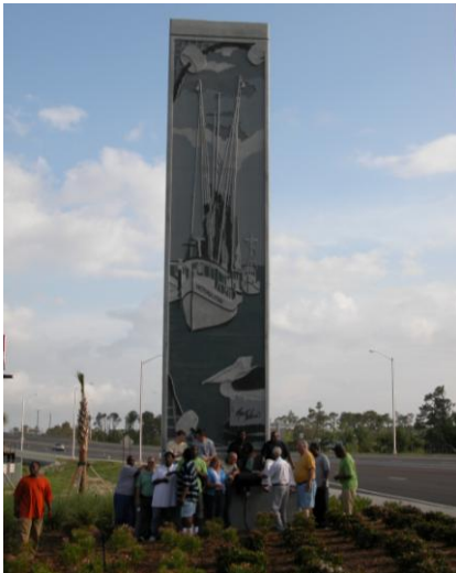
The flood water was as high as the flags are on the top of the poles on the boat